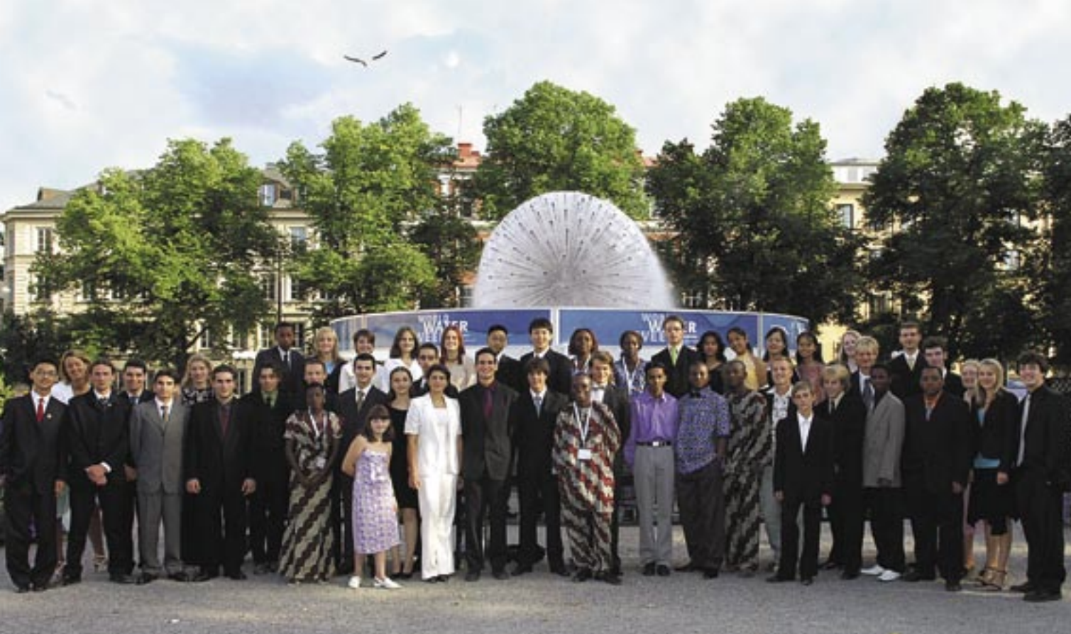
Stockholm Junior Water Prize Finalists, 2005.