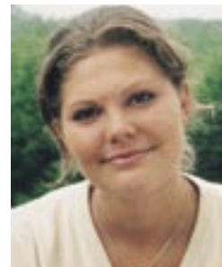
H.R.H. Crown Princess Victoria of Sweden is the Patron of the Stockholm Junior Water Prize.

The winner of the international Stockholm Junior Water Prize receives a USD 5,000 award and a blue crystal sculpture in the shape of a water droplet. The national competitions have inspired young people around the world to become active in water issues.